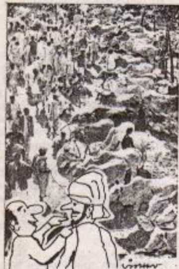
"That one over there is worth buying for Rs 350, since they have spent ten times that money on advertising its sale..."

The decision-maker is like a machine with no inflow and outflow of a recommended course of action. Its mechanism consists of three basic components. They are the prediction system dealing with alternative features; the value system handling the various fluctuating purposes; and the cri-