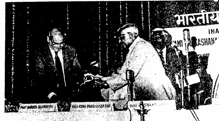
Shri Venkataraman presenting on behalf of the Bhavan, a Tamra Patra to Laureate Dr. Baruch Blumberg in Bombay on March 1, 1986.

A great bhakta at heart Venkataraman who belong to the village of Rajamadom