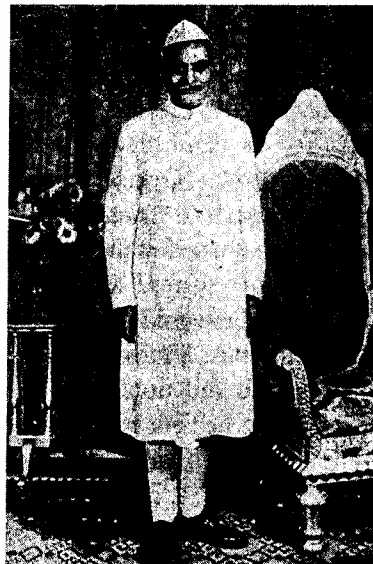
Dec. 3, 1884 to Feb. 28, 1963

turbid; sometimes she courses through a thin channel at the base of two sky-scaling mountains; or sometimes she shyly disappears making her existence known only by the low murmur of her concealed waters. Sometimes receiving the greenish blue waters of some fall or those of some foaming milk-white stream; sometimes rushing over boulders or dancing round them or jumping from one rock terrace to another; sometimes sinking low, looking like a Colorado rushing near the Grand Canyon; sometimes imperceptible, hiding under heavy folds of snow; sometimes emerging, as at Badrinath, almost on the plains a few feet below road level, or swirling fast and furious as at the sacred rock of Naradshila in front of the Temple,--the Alaknanda rises beyond Mana from the road level, to be fed by the Vasundhara water-falls as they descend from Alakapuri, where Kubera, the God of Plenty, resides.